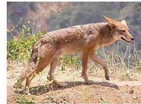
Most coyotes are illiterate