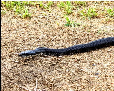
Eastern Ratsnake at the club (Lauren Atwood)

On the same day that the slider paid the club a visit, so did a large Eastern Ratsnake, MD's largest snake out of 27 species & subspecies that call MD home. Its diet consists of small mammals (mice, rats, etc.), birds & bird eggs. Their predators include cats & birds of prey. They are typically docile; I walked within inches of one that was sitting up & waiting to ambush prey next to a sidewalk last year...he didn't move.