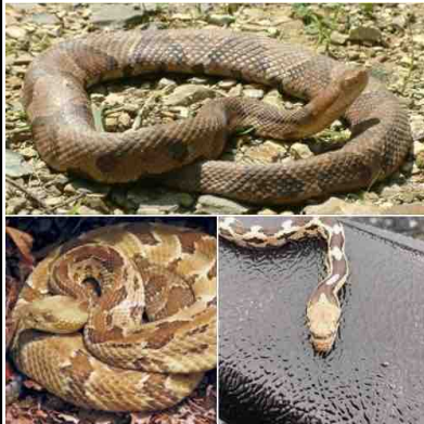
Top: Eastern Copperhead (Linh Phu), Bottom-Left: Timber Rattlesnake (Scott A. Smith), Bottom-Right: Juvenile Ratsnake (Rand Weinberg)

Out of the 27 species & subspecies of snakes in MD, only two are venomous; the Eastern Copperhead (found in all counties except a few on the Eastern Shore) and the Timber Rattlesnake (found only in Western MD counties). These snakes will have slit-like pupils and large, diamond-shaped heads. Juvenile Ratsnakes are often mistaken for Copperheads (see photos at left). It is illegal to kill snakes in MD*, and dangerous to attempt to harm snakes (many bites occur this way).