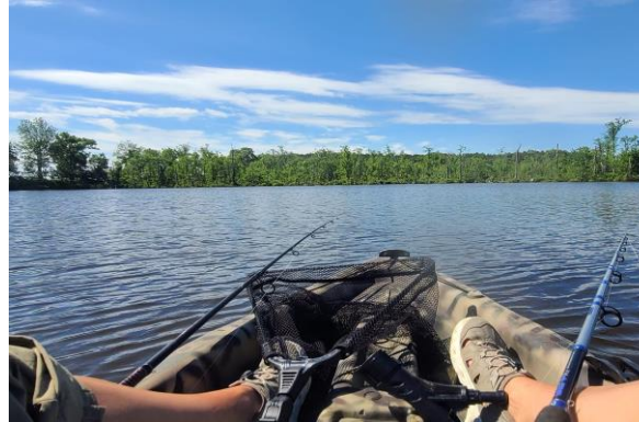
Snakehead fishing from a kayak on the Chicamacomico