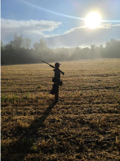
Lauren on the last morning of the 2020 spring turkey season