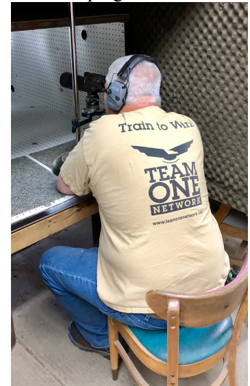
Lee keeping the shoot safe